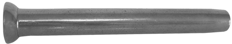
Stemball Terminals for Metric Wire