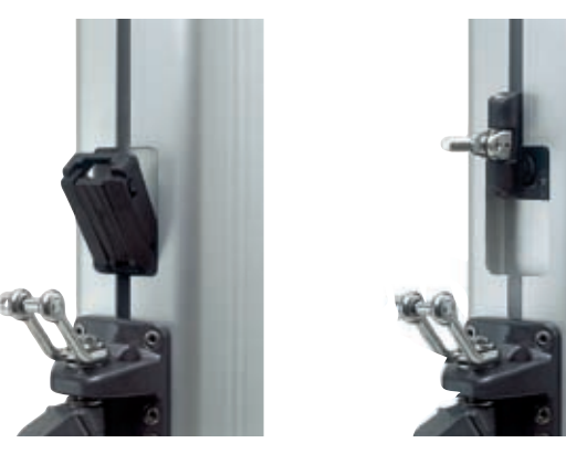
Sail entry gate easily removed to fit or remove Seldén MDS cars.

Sail entry gate C156-C304, Art. No. 505-519-01