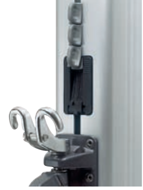
Sail entry gate designed for use with Seldén MDS cars or conventional sail slides. For detailed information about our conventional sail slides, please see Sailmakers Guide, www.seldenmast.com.